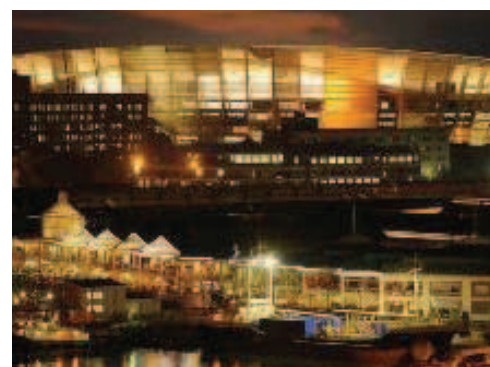
Cape Town's New Stadium